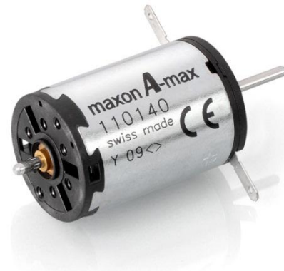
Fig. 1: A-max 22 DC motors by maxon are used for the locking system.

The company uses one maxon motor for each of its security doors. The motor and gearhead combination used in these lock systems consists of a brushed A-max 22 DC motor with 6 Watt of power driving a GP 22 A planetary gearhead. Every motor has an operating speed of up to 6740 min -1 . A-max motors are equipped with a powerful AlNiCo permanent magnet and, like all maxon motors, come with the ironless maxon winding. This motor concept has some very specific benefits, such as low interference and no magnetic cogging. Ruiz López decided to use maxon products because of their extreme reliability, high quality and long service life.