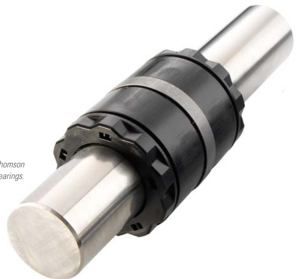
Thomson Linear Bearings.

An increase in clearance is sometimes a sign that a bearing is about to fail. On a plain contact bearing you can often feel or see slop on the interior of the bearing. If the application does not require close tolerances then clearance may not have to be addressed immediately, however, if the application has accuracy requirements then immediate attention is needed. Unusual noise or vibration is often an indicator of a bearing problem. A worn bearing race can in certain cases be detected by an increase in noise and particulate matter although there are often cases where bearings will sound perfectly normal until they fail.